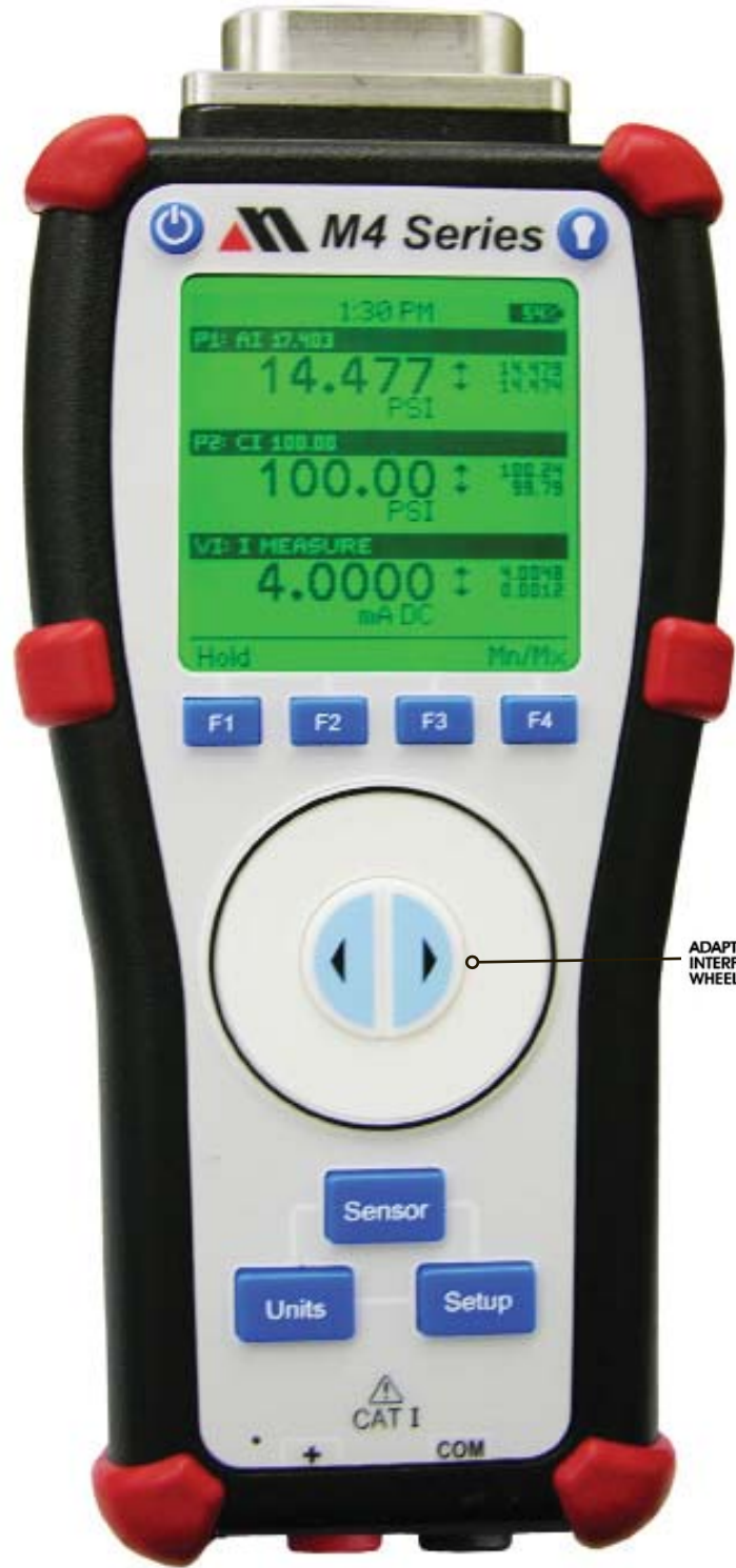
unit shown approximate size

All M4 Series handhelds provide convenient electrical signal measurement and sourcing. Measure ±50V or ±100mA, source 24VDC and measure mA, sink mA, or source precise VDC or mA DC values using the supplied test leads. Accuracy is ±(0.015% of Reading + 0.002 units) over the entire operating temperature range. Source or sink values are easily entered using the Adaptive Interface Wheel.