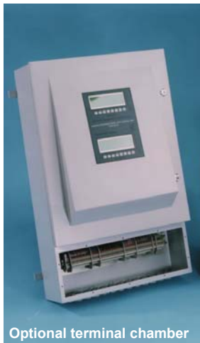
Optional terminal chamber